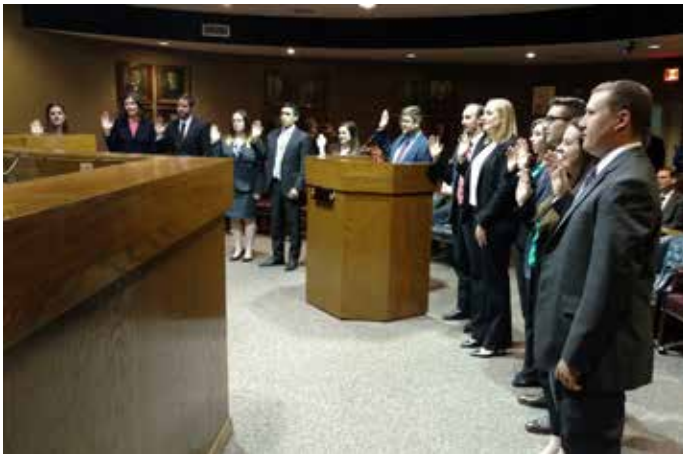
Thirteen new attorneys were sworn in on November 14, 2016. Congratulations to everyone who passed the bar!